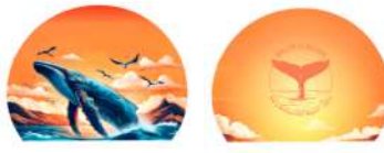
Swimming cap made of fabric for kids (1-12 yo)