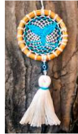
Handmade Dreamcatcher with whale tale design (limited stock)