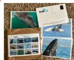
Pack of 12 Whale Postcards