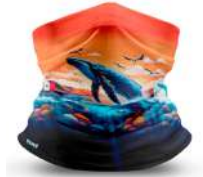
Buff - Sea and Mountain Special Edition