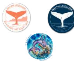
SET of 5 Stickers Swim for the Whales (de 5x5 cms. y 7.5x7.5 cms.)