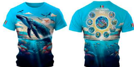
T-shirt Sea and Mountain / Special Edition (dry-fit style ) women's, men's and kids