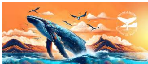
Microfiber towel – Sea and Mountain Special Edition