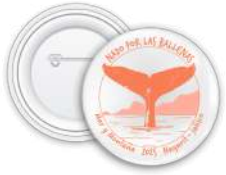
Pin (5.5 cm)