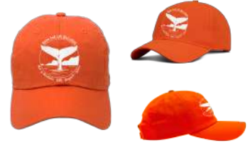
Sun Cap Adults and kids (8 to 12 yo)